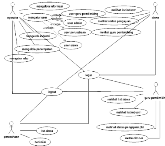
Fig. 4. Implementation of Use Case Modeling