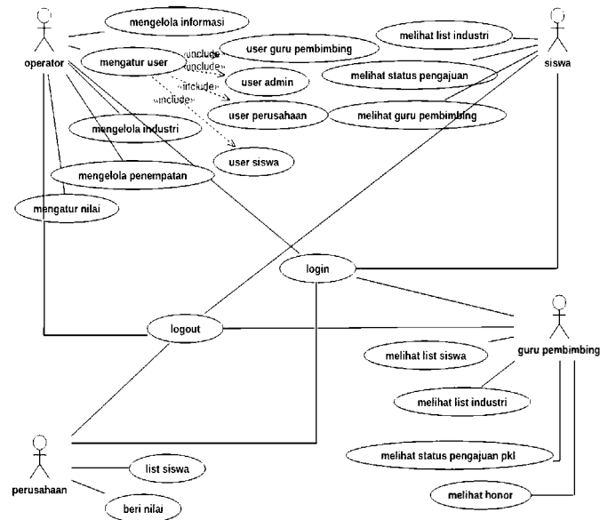
Fig. 4. Implementation of Use Case Modeling